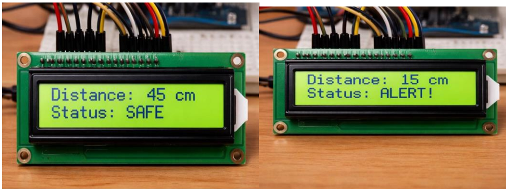
Fig:3 Safe condition display